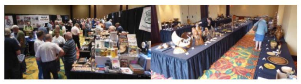
The Mid Atlantic Woodturning Symposium will be held on September 22rd – 24th in Lancaster, PA.

MAWTS is a three day opportunity to meet and learn from some of the worlds greatest turners. None of these professionals will be at the AAW Symposium in Chattanooga, so this is your opportunity to see them live and up close!