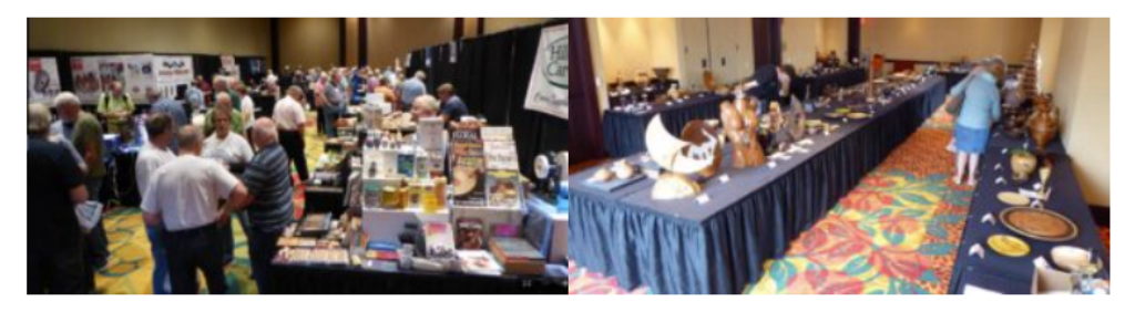
The Mid Atlantic Woodturning Symposium will be held on September 22rd – 24th in Lancaster, PA.

MAWTS is a three day opportunity to meet and learn from some of the worlds greatest turners.